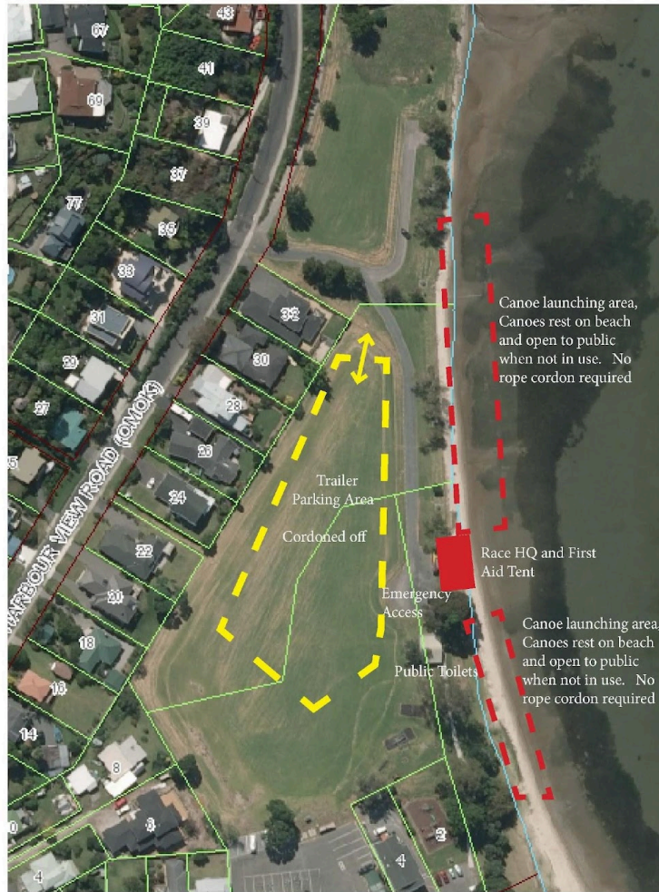
Tauranga Moana Outrigger Canoe Club Omokoroa Dash Outrigger Canoe Event Plan of Event Set Up Area